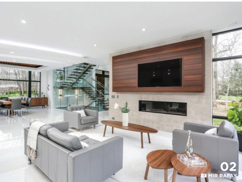
02 MIR RAFAY