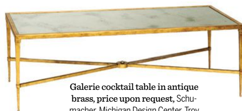
Galerie cocktail table in antique brass , price upon request, Schumacher, Michigan Design Center, Troy